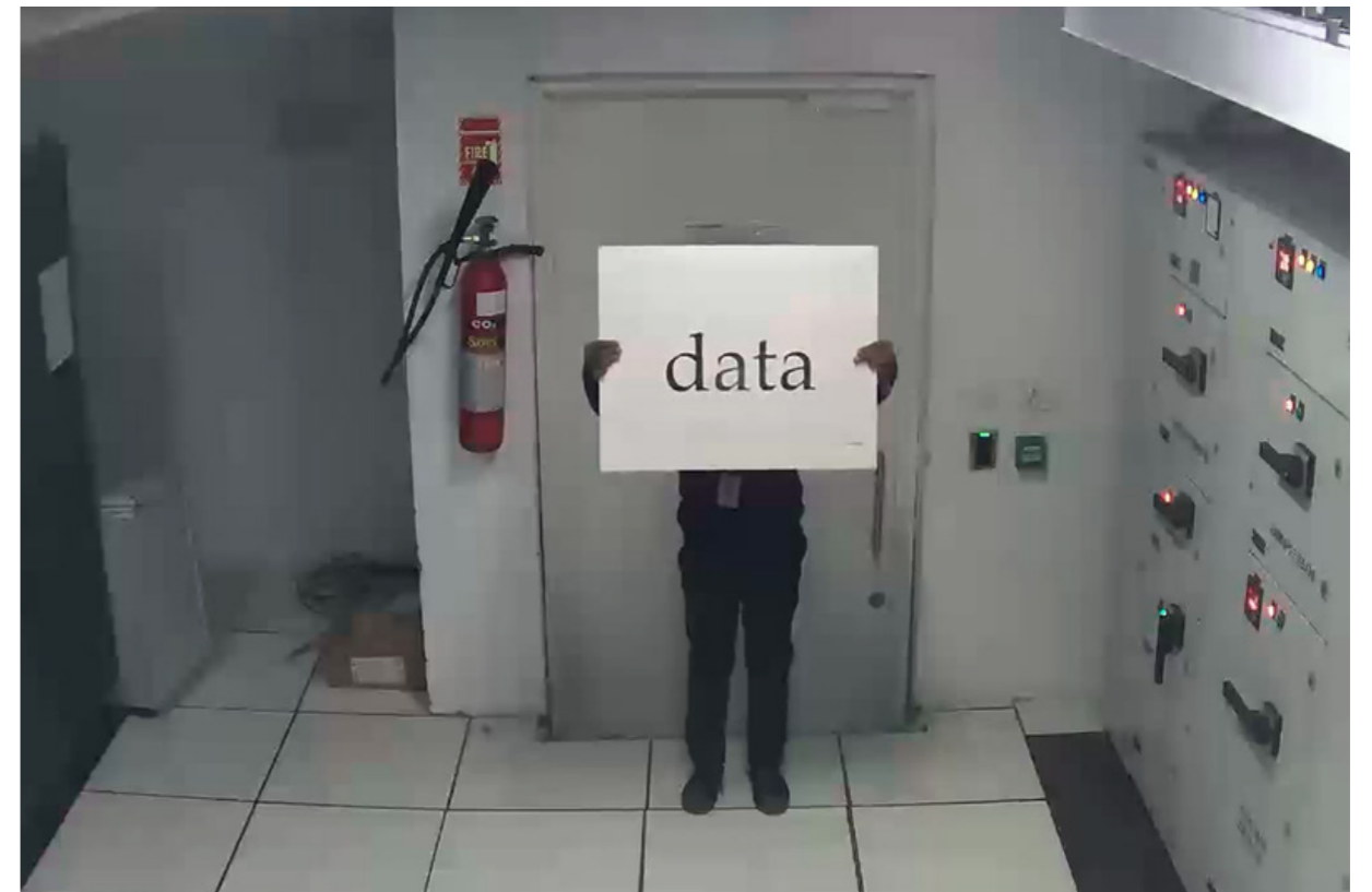
Kafka's Castle (2016)

65 low-resolution photography prints on sun board