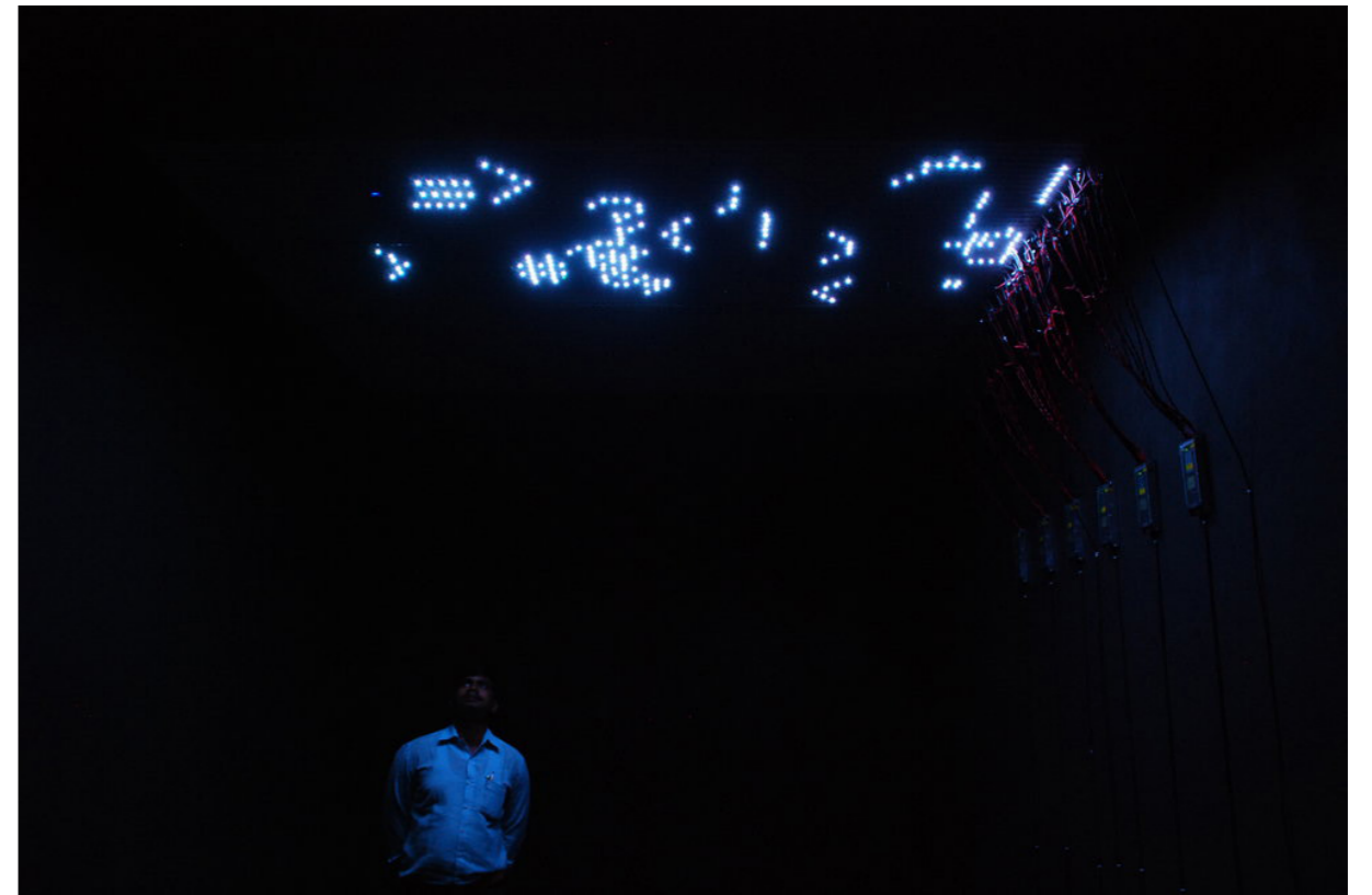
What the Frog's eyes can not tell the brain (2017)

Neopixel LEDs, Arduinos, Code, Wood, Metal frame, Wires & Power Adapters